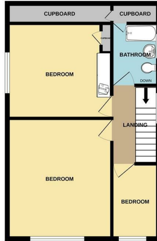
1ST FLOOR 509 sq.ft. (47.3 sq.m.) approx.